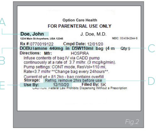
For demonstration purposes, follow the instructions on YOUR medication bag.